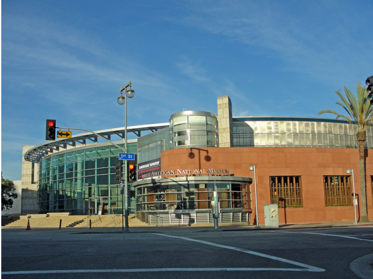
Figure 2. Japanese-American National Museum (100 N Central Ave, Los Angeles, Ca 90012).