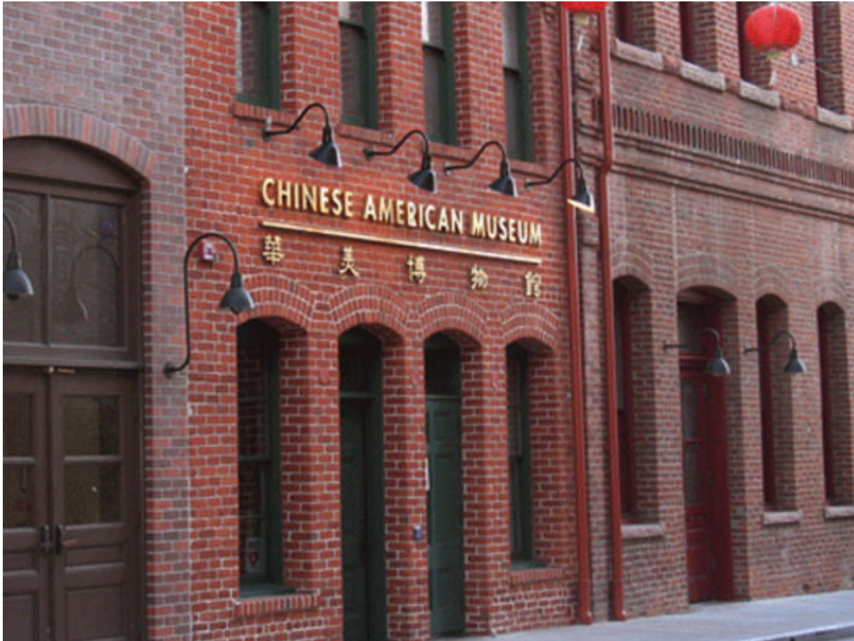
Figure 1. Chinese-American Museum (425 N. Los Angeles Street, Los Angeles, CA 90012.

Indonesians and violent rioting against them. In Viet Nam, in the last two decades, wealthy business people from China's Mainland and Taiwan invested a lot of money and made huge fortune, but failed to give back sufficiently; some of them engaged in ethically and legally inappropriate commercial behaviors; and in recently years, there are several waves of rioting against them, resulting in huge economic damages to their businesses.