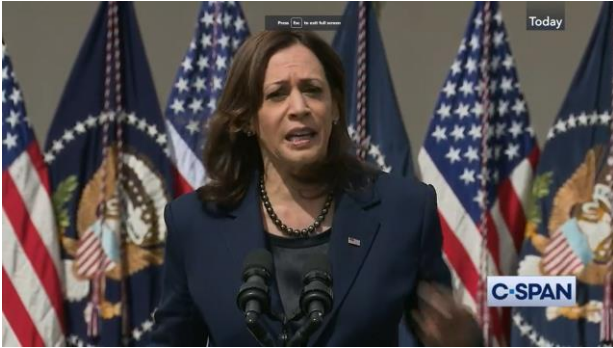
Vice President Kamala Harris recalled her past endeavors to end gun violence.