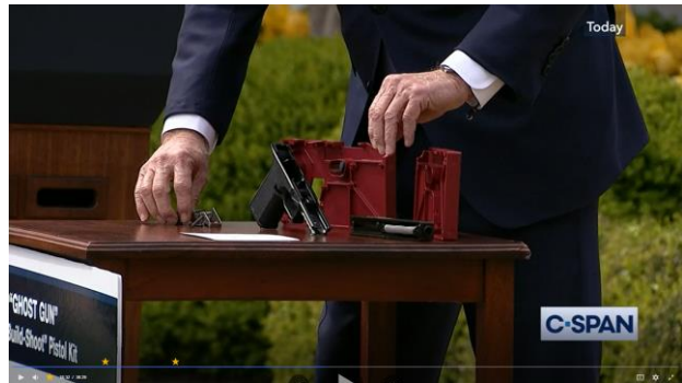
President Biden demonstrated how easy it is to assemble a “ghost gun.”