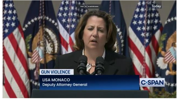
Deputy Attorney General Lisa Monaco explained measures taken by the Department of Justice to fight gun violence in cooperation with other law enforcement agencies.