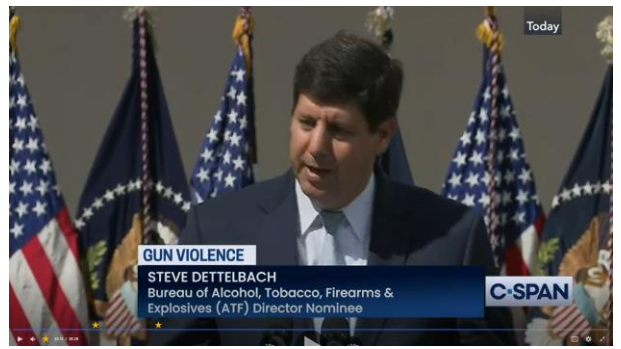
Bureau of Alcohol, Tobacco & Explosives (ATF) Director Nominee Steve Dettelbach spoke about his efforts at supporting the fight against gun violence.