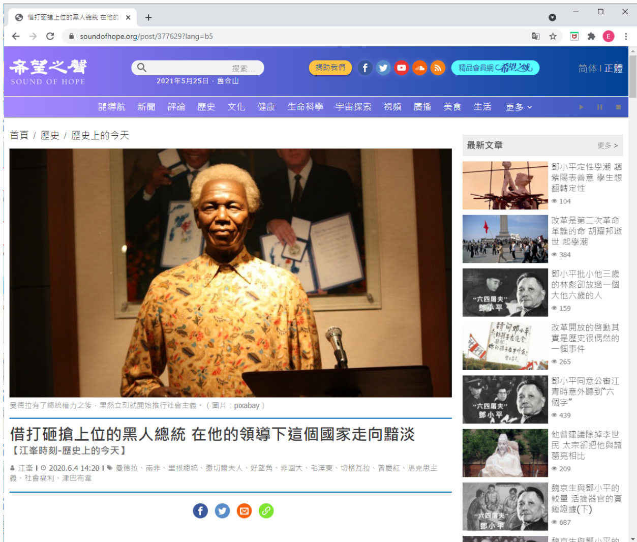
Figure 2. Online article denouncing former South African President Nelsen Mandela as a “Communist terrorist.”